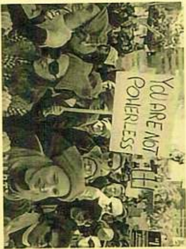
Women's March, 2017